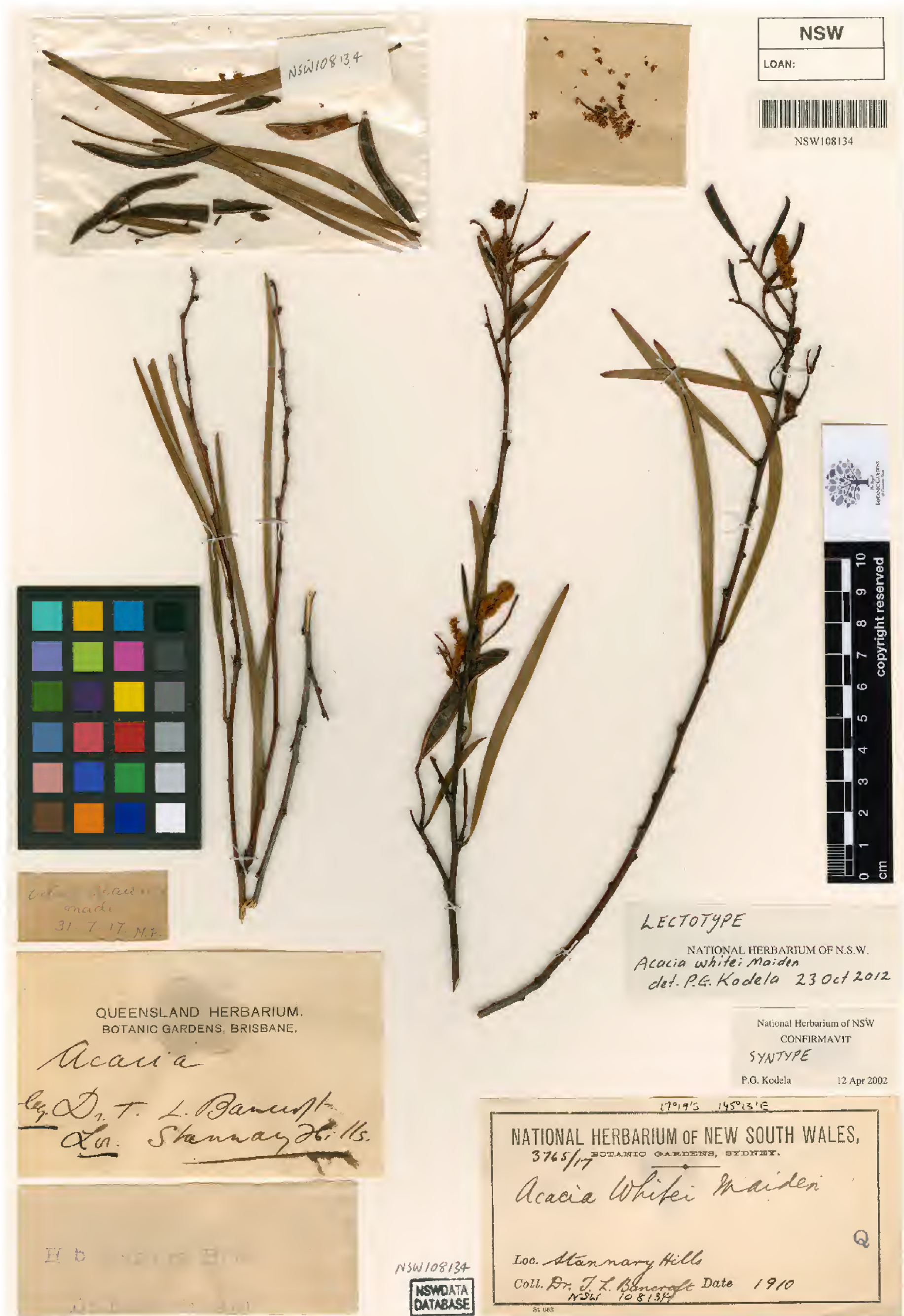
Fig. 6. Lectotype of Acacia whitei Maiden, NSW108134